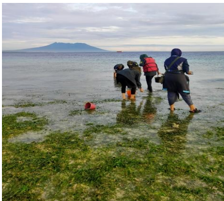
Figure 4a. Students explore the beach, looking for specimens

Connection activities between map concepts that have been compiled with specimens found in the field are presented in Figures 4a and 4b.