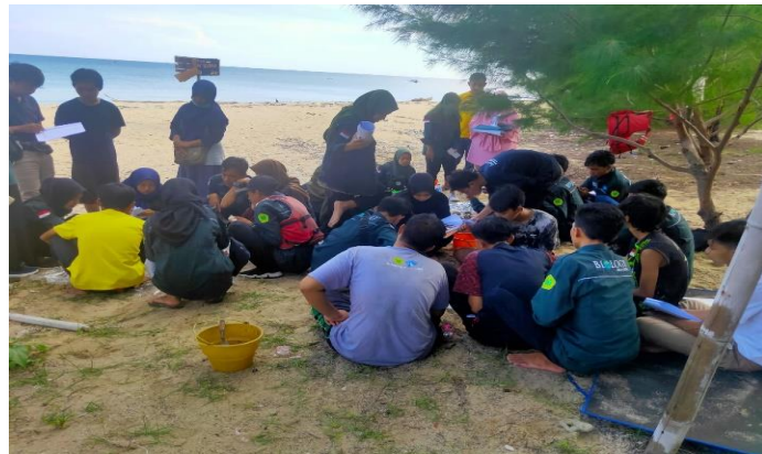
Figure 4b. Students connect the map concept that has been compiled with the specimens found in the field