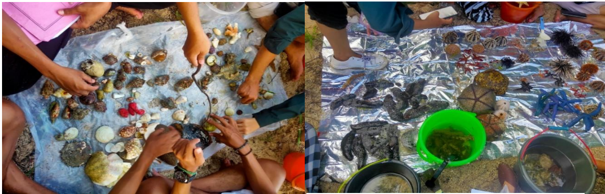
Figure 3a. Specimen found, from class Mollusca.

For example, the specimens found during the field study are presented in Figures 3a and 3b.